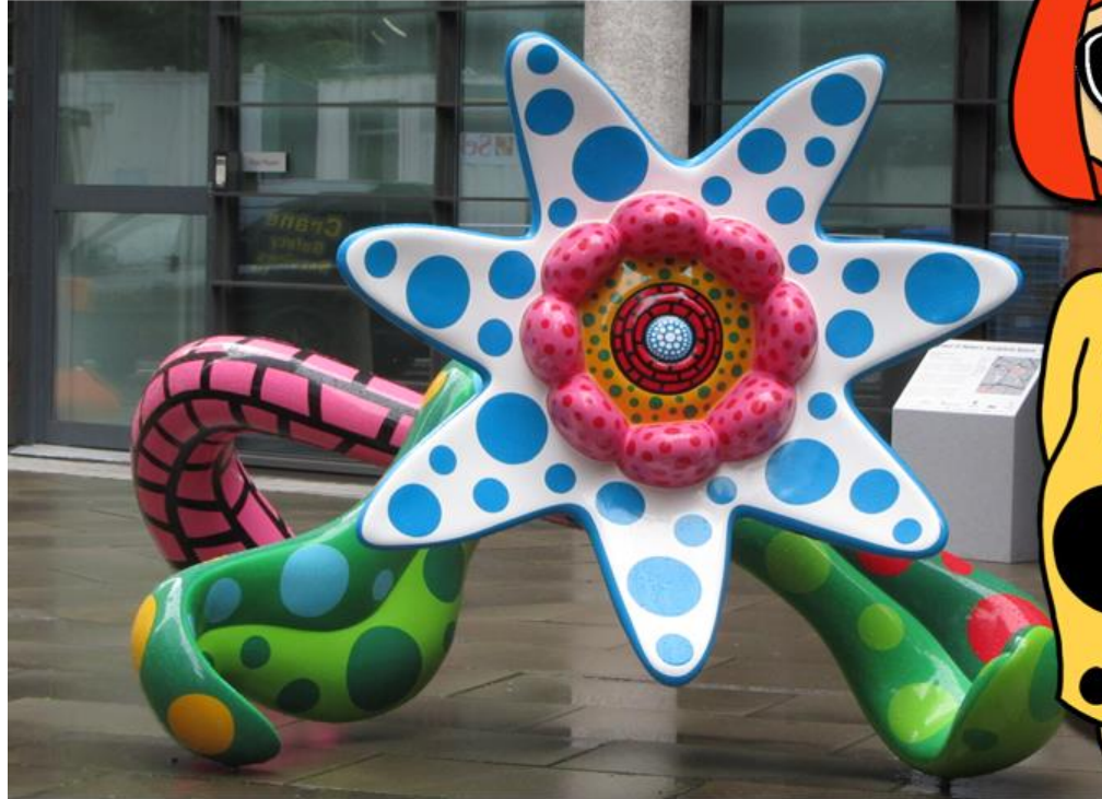
Yayoi Kusama - Flowers That Bloom Tomorrow, Square Mile, London, 2012

SHE LIKES TO MAKE SCULPTURES TOO! OF COURSE, THEY ARE COVERED IN DOTS!