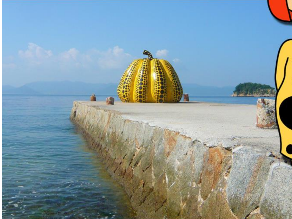
Yayoi Kusama - Pumpkin, 1994, Benesse Art Site, Naoshima, Japan

YOU CAN WALK AROUND THIS PUMPKIN BY KUSAMA. THIS PUMPKIN IS A SCULPTURE!