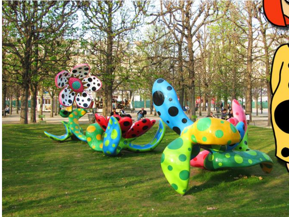
Flowers That Bloom At Midnight, 2009, Tuileries Gardens, Paris

DO YOU THINK YOU WOULD BE ABLE TO WALK AROUND THIS ARTWORK BY KUSAMA? IS THIS A SCULPTURE?