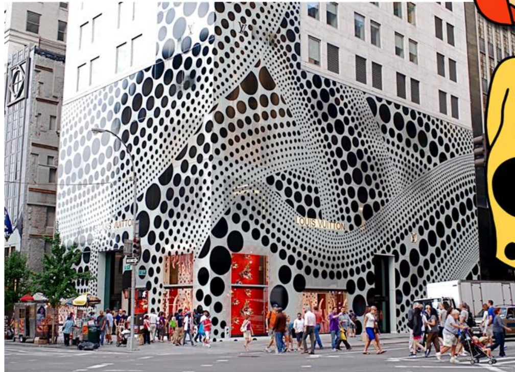
Louis Vuitton Flagship Store in NYC.

THIS STORE IN NEW YORK CITY USED KUSAMA DOTS TO DECORATE THE OUTSIDE OF THEIR BUILDING!